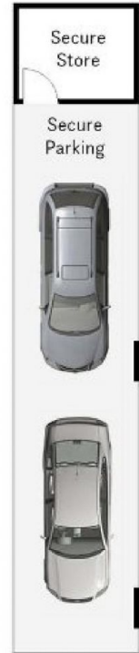
CAR PARK LEVEL-2