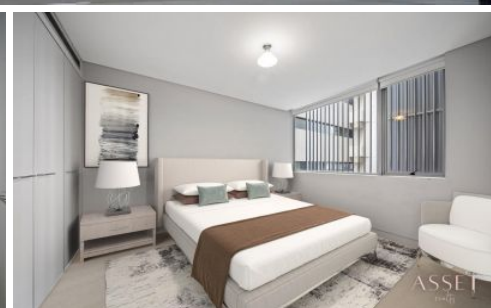
303/11 Chandos Street St Leonards NSW

Designer Apartment with Refined Finishes Throughout